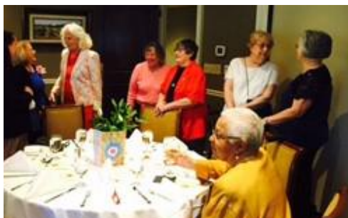
A great time was had by all!!