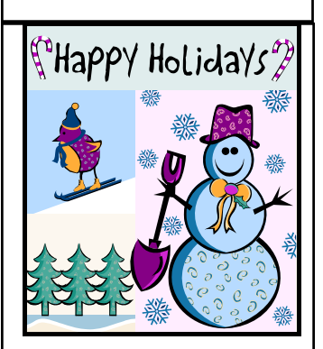
LET IT SNOW!!