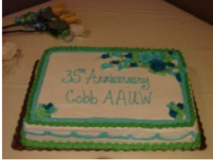
Our celebration cake!!