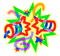
A beautiful venue and a good time was had by all!!