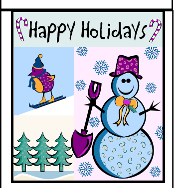
OH - WHAT FUN..!!