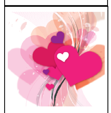
Happy Valentine's Day